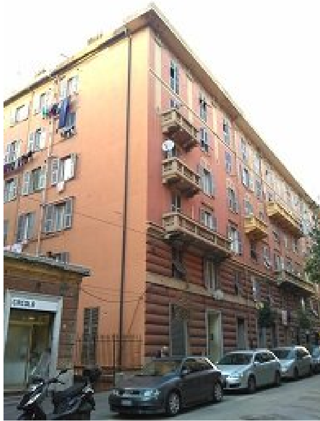
Vista esterna condominio