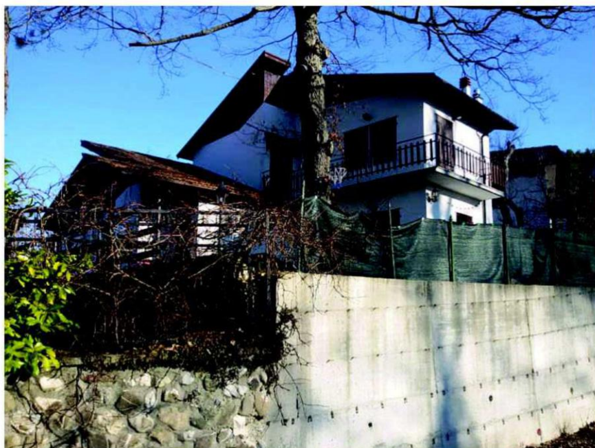
2 prospetto sud - est