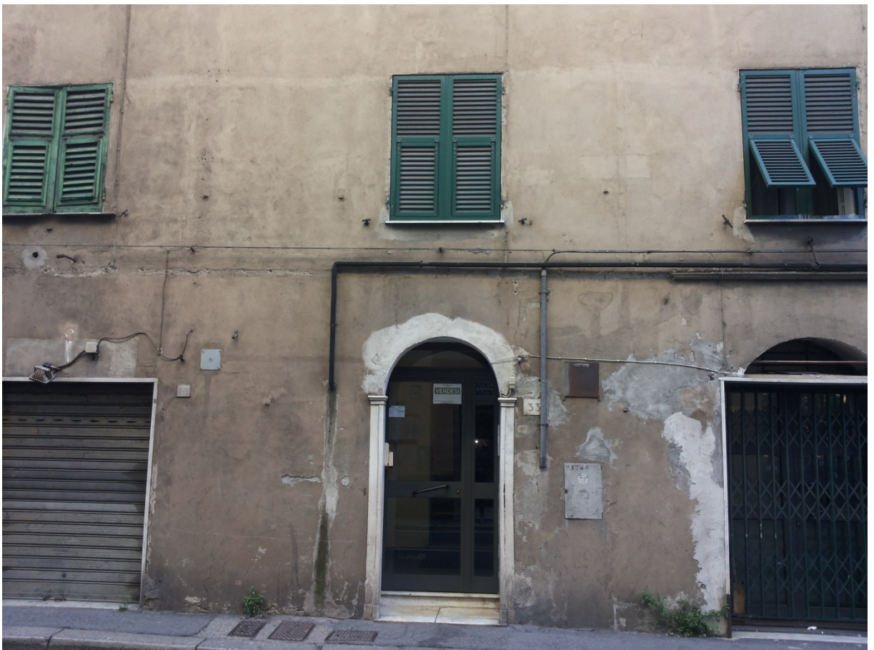
Via Teglia civ. 33 int. 8 - 16161 Genova